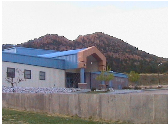
The new Cotopaxi High School was built in the late 90's thanks to the 1.5 million dollar bond issue passed by District voters in 1995.

The new bonds will be paid off in eight years.